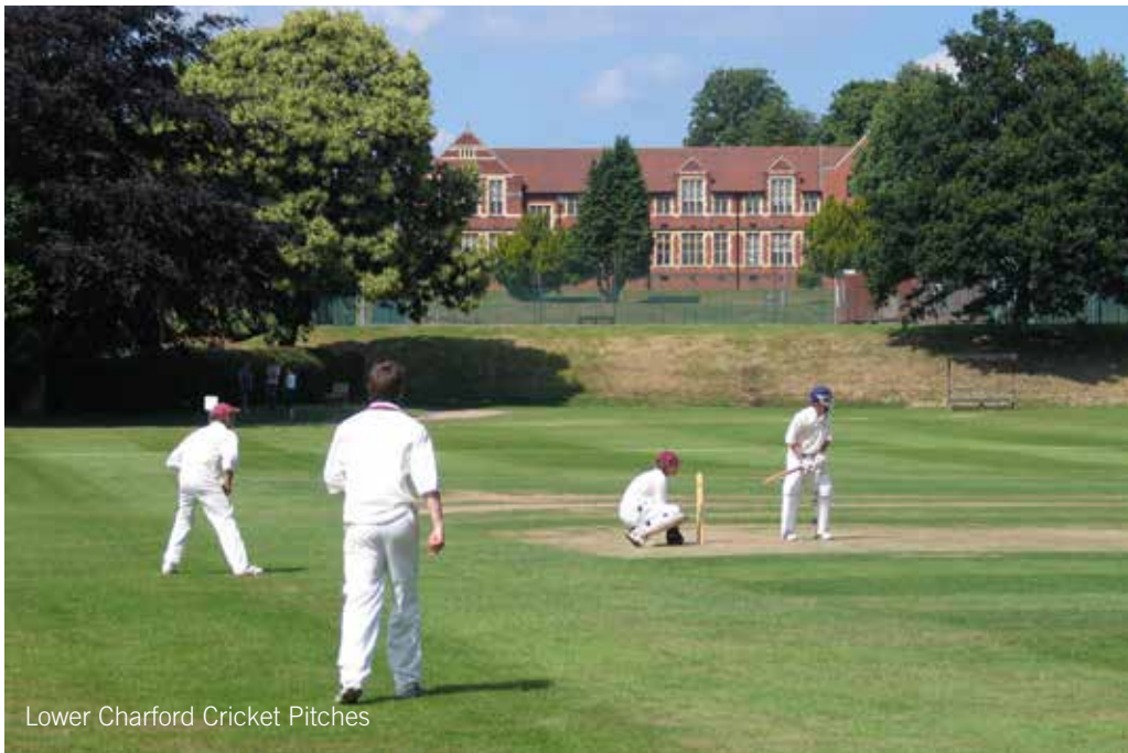
Lower Charford Cricket Pitches