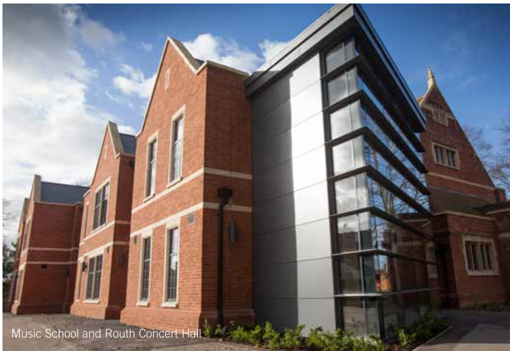
Music School and Routh Concert Hall