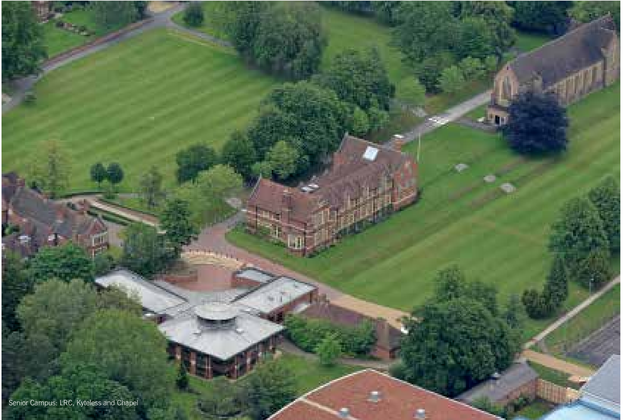
Senior Campus: LRC, Kyeless and Chapel