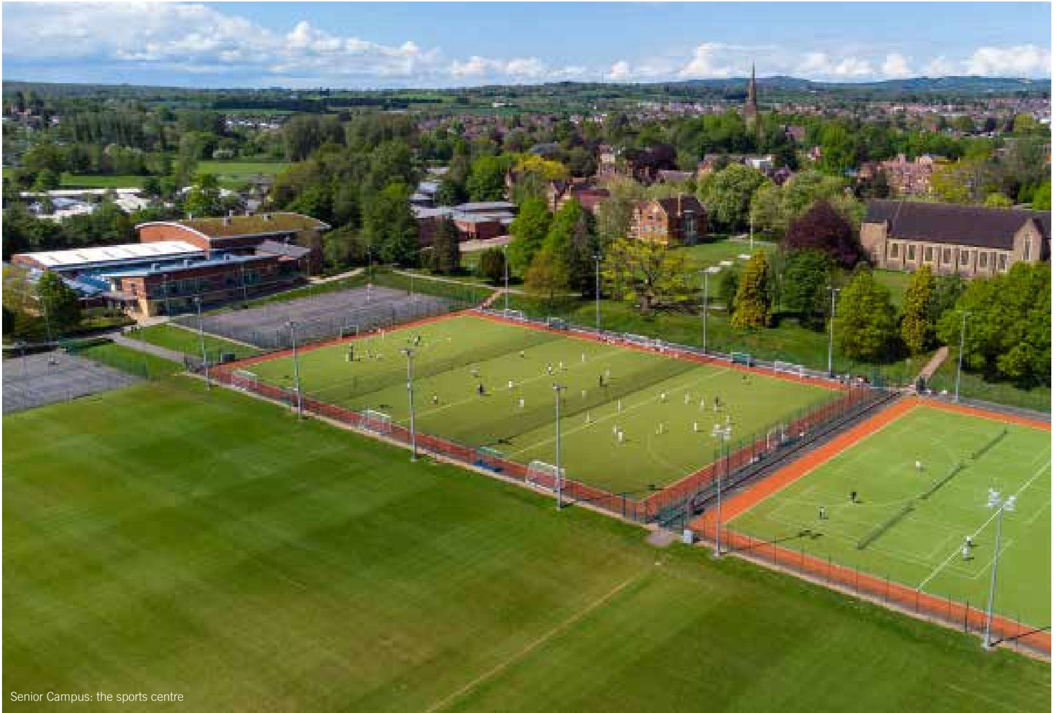
Senior Campus: the sports centre